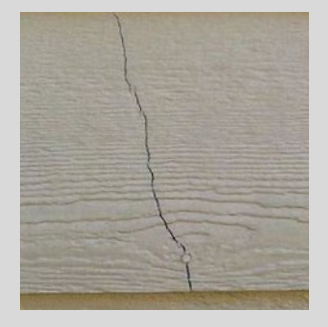
Cracking: RISE Siding won't crack like other more brittle siding