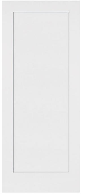
1 Panel Shaker Smooth Square Sticking 6/8 🔥 8/0 🔥