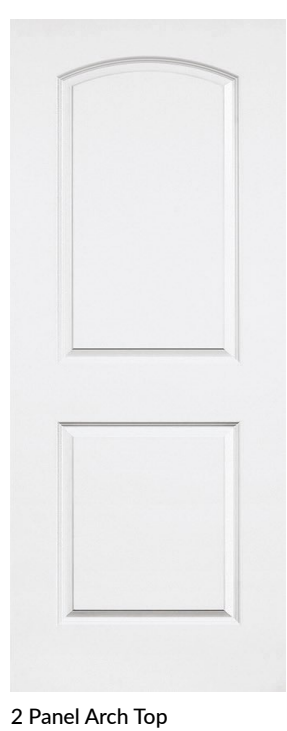
Smooth Bead & Cove Sticking 6/8 🔥