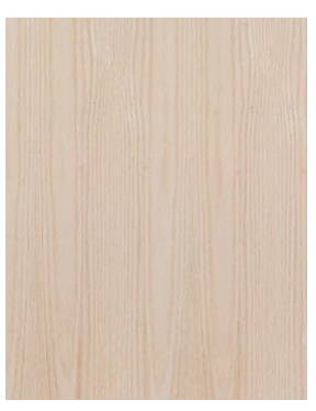
Birch Smooth 6/8 🔥