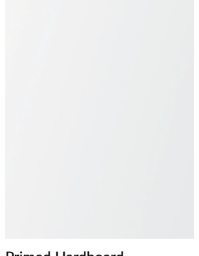
Primed Hardboard Smooth 6/8 🔥