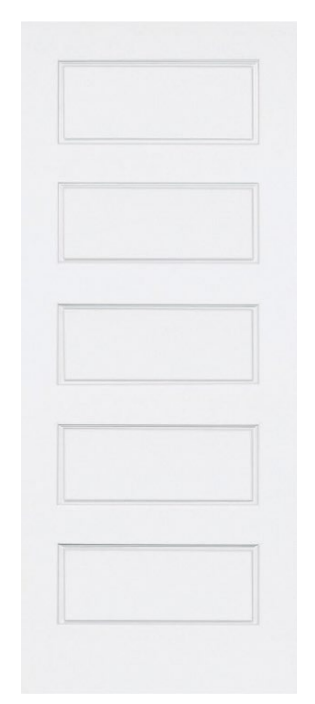
5 Panel Shaker Smooth Step Sticking 6/8 🔥