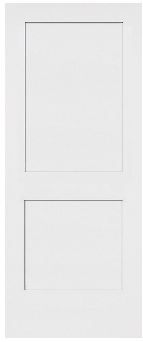
2 Panel Shaker Smooth Square Sticking 6/8 🔥 8/0 🔥