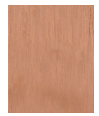
Lauan (Mahogany) Smooth 6/8 🔥