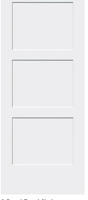
3 Panel Equal Shaker Square Sticking 6/8 🔥 8/0 🔥