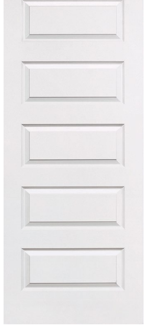
5 Panel Smooth Bead & Cove Sticking 6/8 🔥