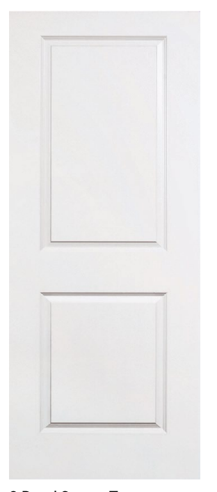
2 Panel Square Top Bead & Cove Sticking 6/8 🐧 8/0 🐧