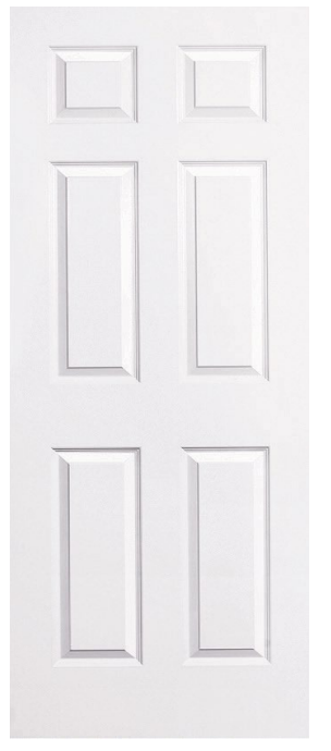
6 Panel Smooth & Textured Bead & Cove Sticking 6/8 🔥