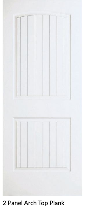
Smooth Ovolo Sticking 6/8 🔥