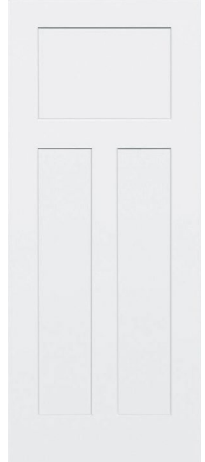
3 Panel Craftsman Shaker Smooth Square Sticking 6/8 🔥