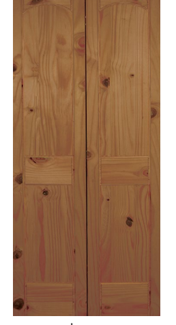
82A BF | Raised