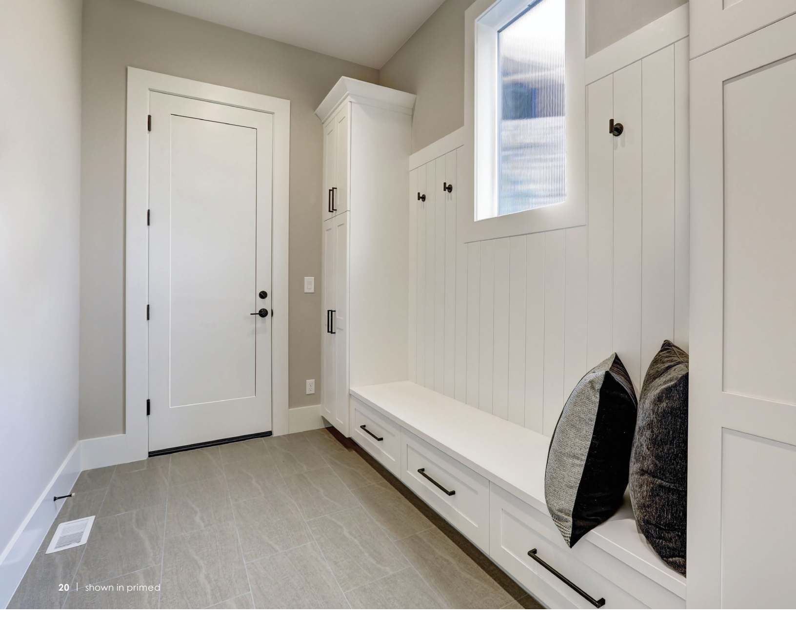
TRADITIONAL | PRIMED