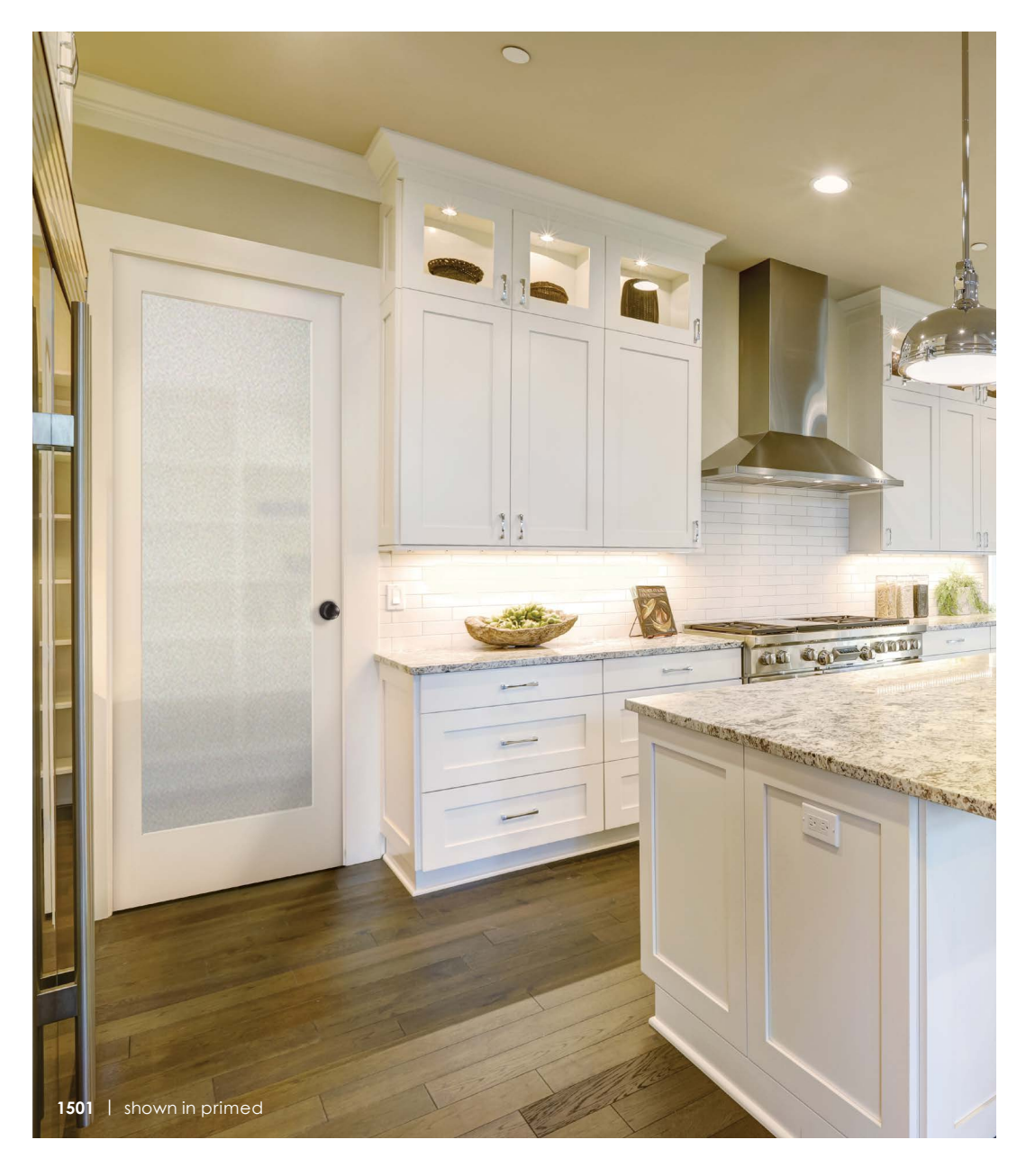
DECORATIVE FRENCH | PRIMED