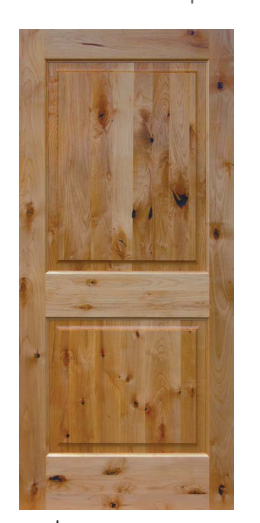
82 | Raised