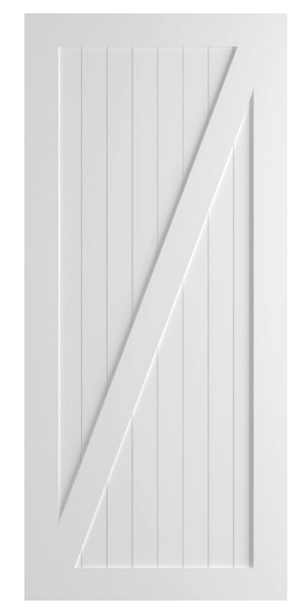
201V V-GROOVE (REVERSIBLE)