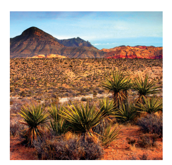
Effective across a wide range of temperatures

Helps keep out water and wind-driven rain, providing an ideal solution in regions with heavy precipitation.