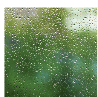
Allows moisture vapor to escape

Helps with energy savings in every season, especially in regions that experience wide changes in temperature and extreme climate conditions.