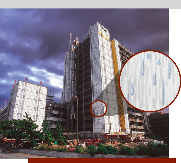
DuPont Tyvek CommercialWrap D has a specially engineered surface texture that provides an enhanced drainage plane for wall systems and climates that may require additional drainage.

DuPont" Tyvek Commercial Wrap D offers superior drainage and durability for commercial buildings.