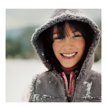
Improves air control for greater energy savings

While construction materials and practices may vary by region, the need for energy savings is universal. Fortunately, the unique balance of properties and superior vapor permeability of DuPont Tyvek Commercial Wrap D make it equally effective across a wide range of challenging environments—including areas of heavy rainfall, wind, snow or humidity.