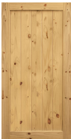
201V V-GROOVE (REVERSIBLE)