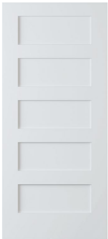
55 | Flat