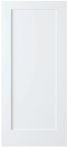
20 | Flat