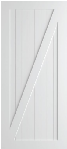
201V V-GROOVE (REVERSIBLE)