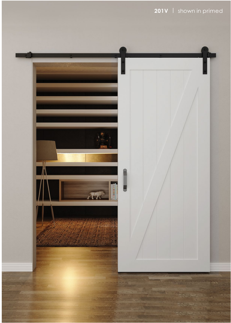
201V | shown in primed