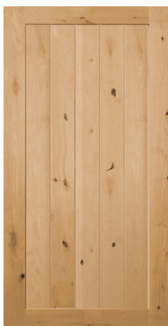
201V V-GROOVE (REVERSIBLE)