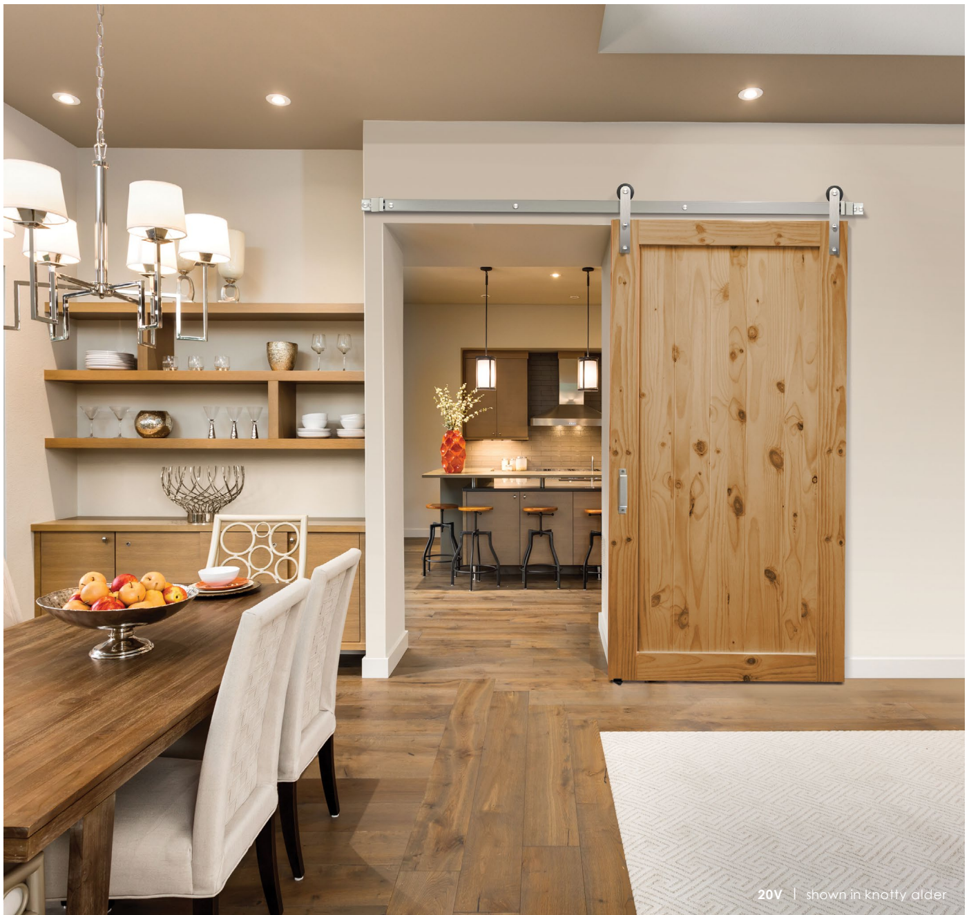
20V | shown in knotty alder

Turn any doorway into a statement by adding a sliding barn door. This versatile door style adds charm and character while making the most of your available space. Customize your barn door to match your style, whether you prefer the rustic look or a more minimalist aesthetic.